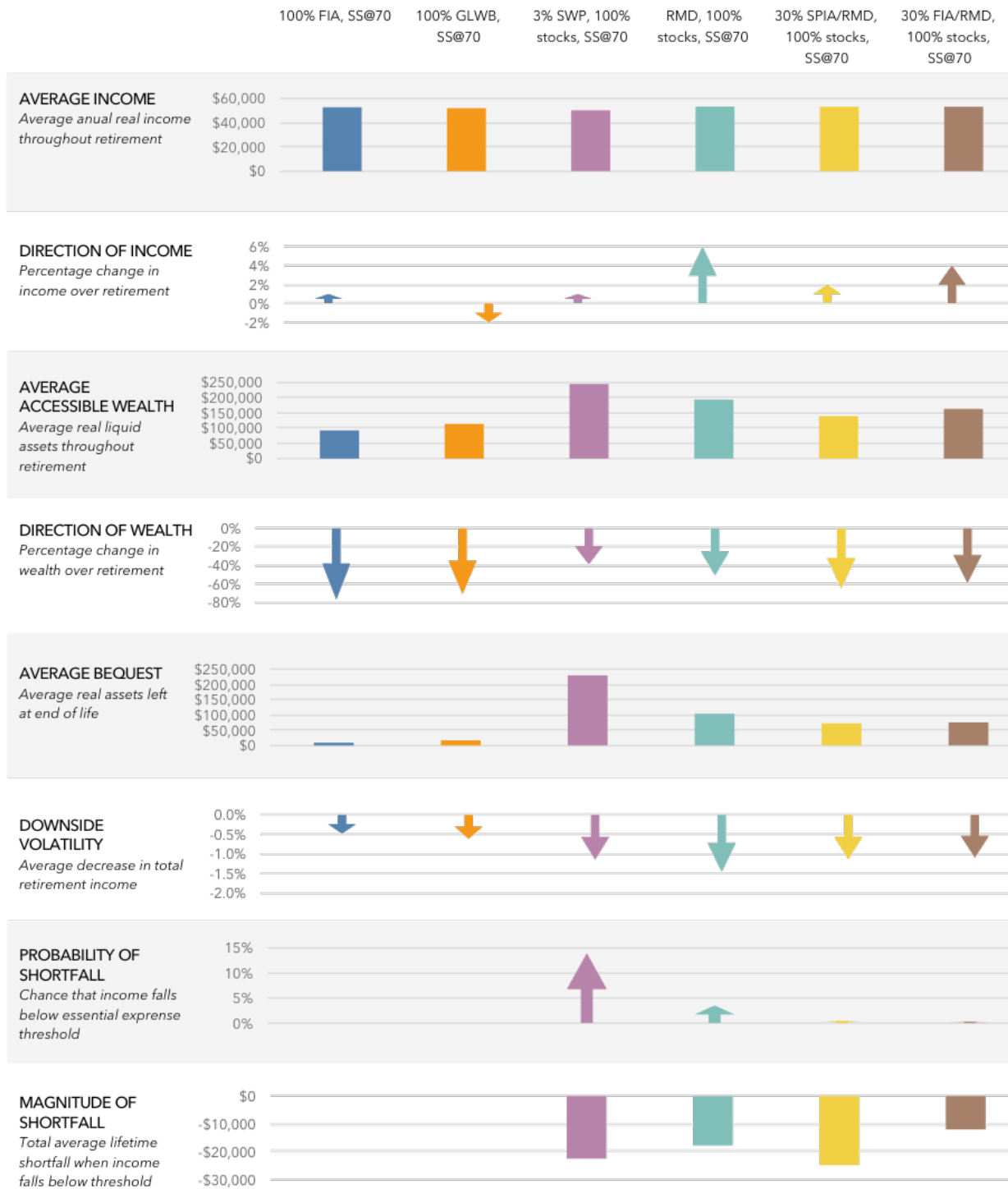
Figure 2: Sample dashboard comparing various retirement income solutions for a 65-year-old married couple with $400,000 in retirement savings.

Set 4: Compare high-performing solutions near the efficient frontier