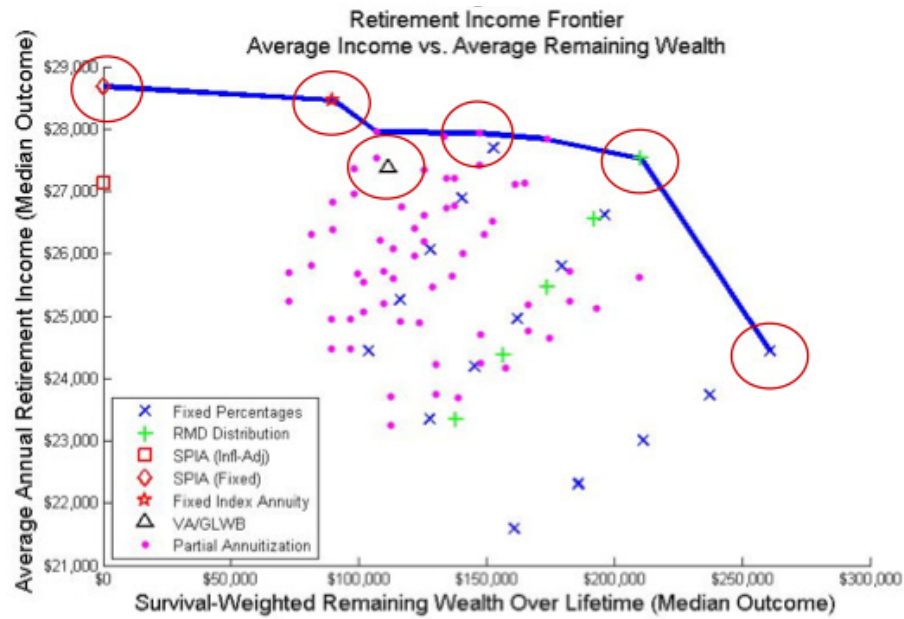
Figure 1: Start with solutions near the efficient frontier